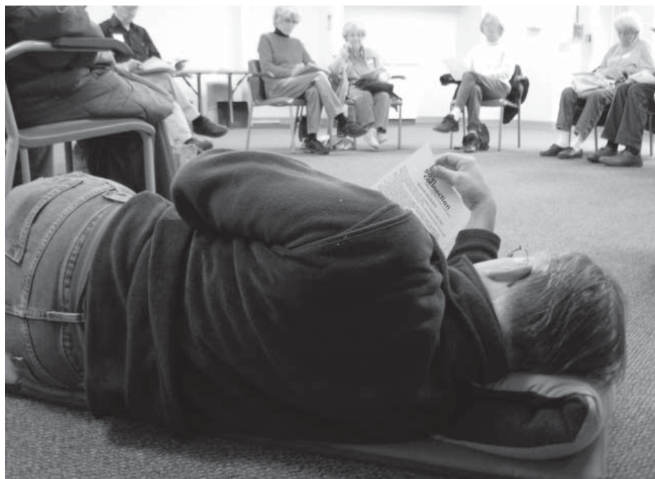
Montgomery County Support Group: Dealing with holidays.